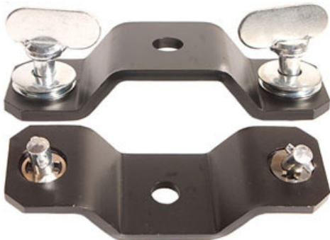
Omega Bracket (optional - not included)

IP65 Locking Power Cable Glare Shield (2) Lens Filters