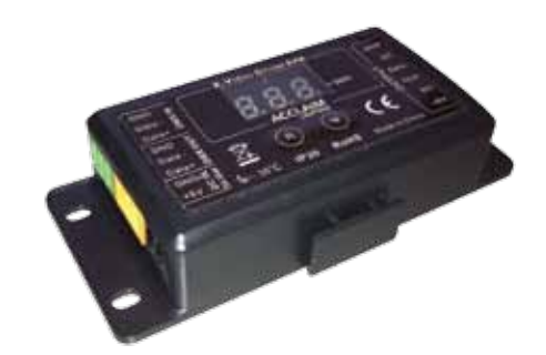
Flex Pixel Driver (FLE768)