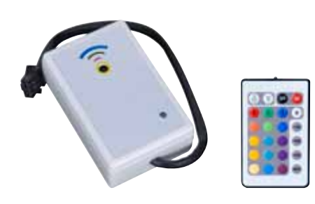
Flex Pixel IR (FLE755)